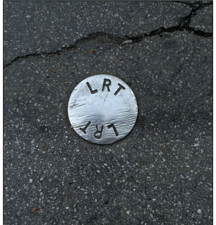
Not previously noted in Underground News before are these LRT boundary markers along the pavement outside the Praed Street building of Paddington station on 11 October 2022. Of course, many boundary markers exist around the Underground and a selection of some others are shown opposite.