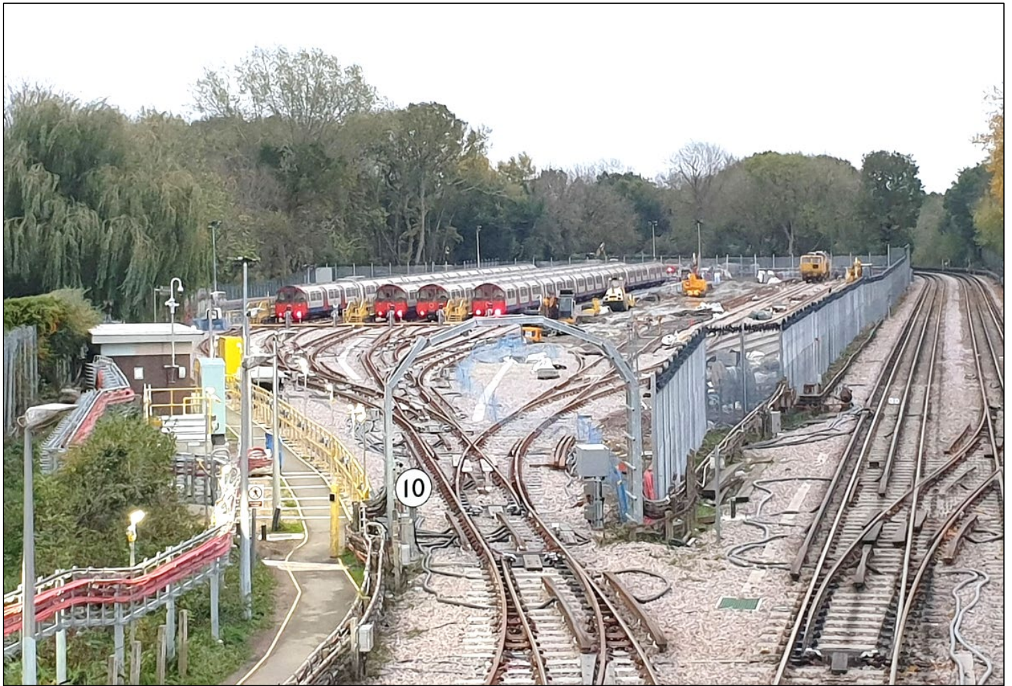
Above: South Harrow on 10 November 2022, with four trains of 1973 Tube Stock stabled in the new sidings. Project completion is not now expected until early-2023.