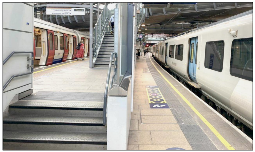
requirements is just a few yards apart here at Farringdon between LU (Left) and Thameslink (Right).

Even though Monday 19 July was coined by some to be "freedom-day", it was noted that the east end entrance at Aldgate East remained closed although the one way systems had been noted as removed at Liverpool Street, Finsbury Park and Stratford.