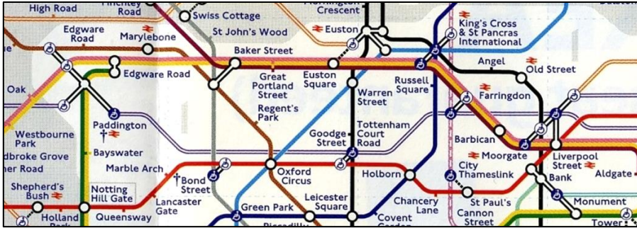
Right: The cover of the May 2022 "Tube Map".